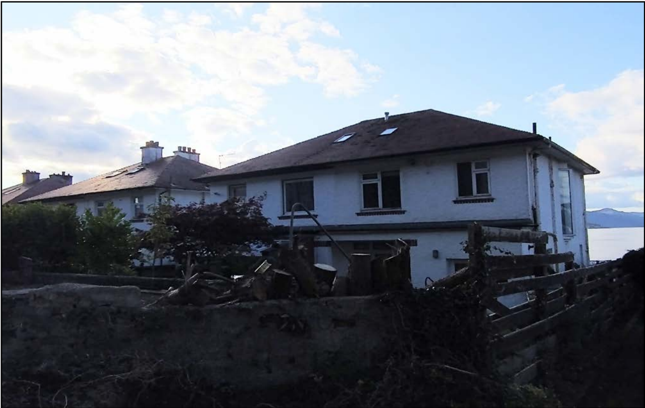
View of the rear of 68 Cloch Road from Cameron Court

With regards to other factors outlined in PAAN 6 the proposed dormer window is considered subordinate to the existing roof in terms of its shape and size; is below the ridge line of the roof and is set back from the gable end. The choice of cladding compliments the existing roof material.