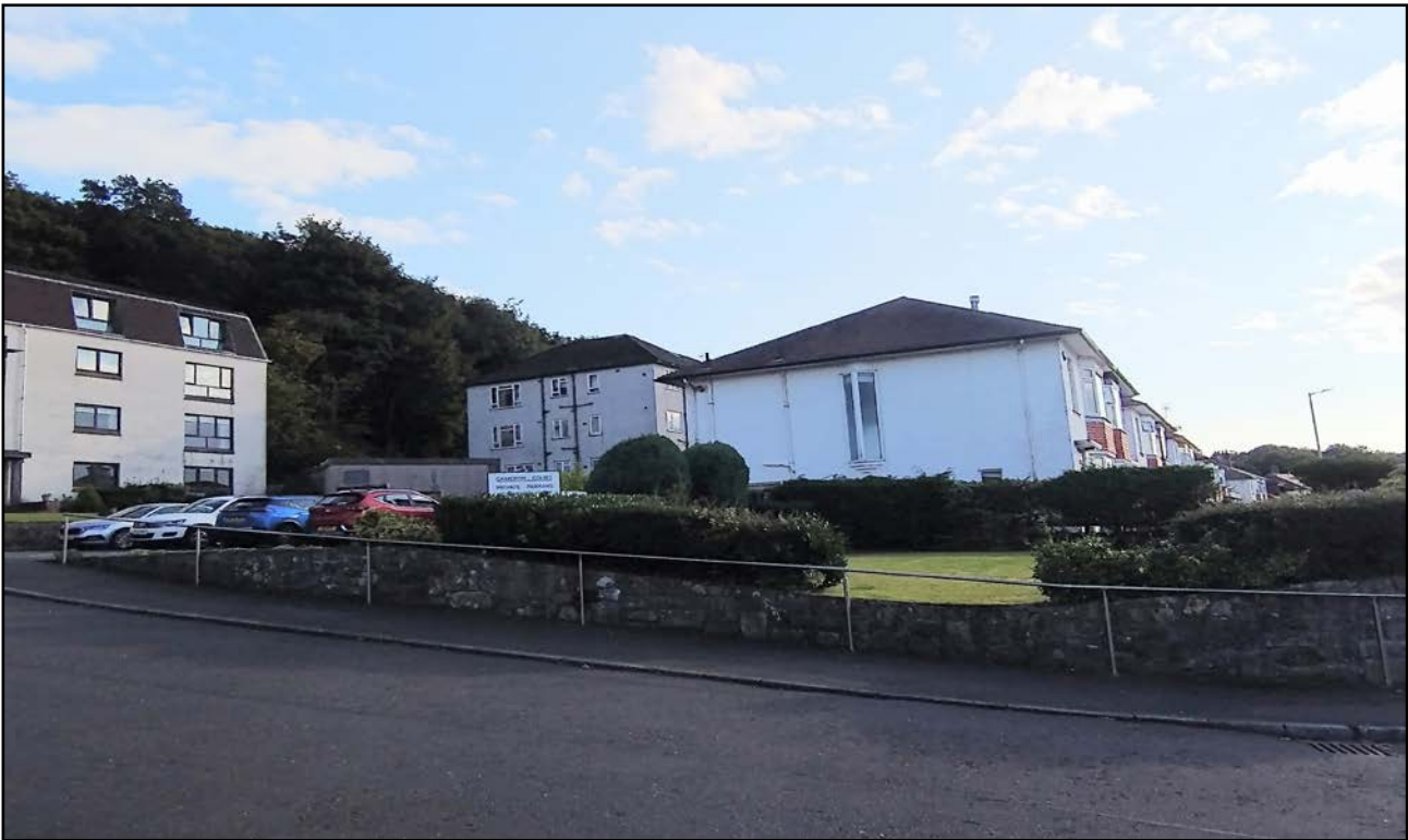
View of 68 Cloch Road from the east

Policy 20 of the proposed LDP additionally requires development within residential areas to be assessed with regard to impact on the amenity, character and appearance of the area. Where relevant, assessment will include reference to supplementary guidance. Both the adopted and draft PAAN 6 are of relevance.